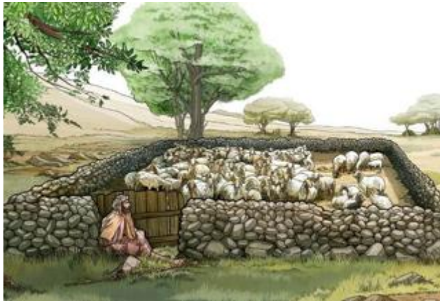
I am the good shepherd John 10: 11-18