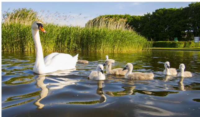
Swan and cygnets in the pond on the common

Please arrange to swap if unavailable for the allotted date